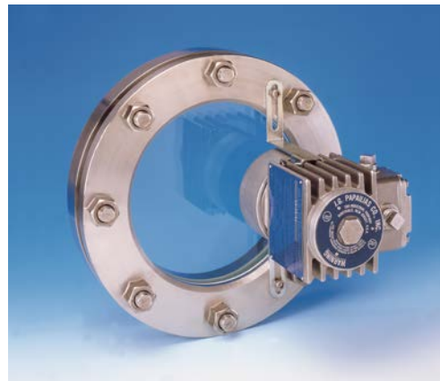
PAPAILIAS, Inc. Series SLEX-100 Explosionproof Light Mounted to Series NW Weld Pad Style Sight Glass