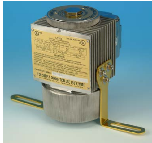
PAPAILIAS, Inc. Series SLEX-100 UL-844 Listed Explosionproof Light