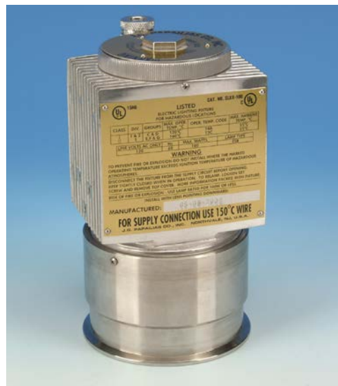
PAPAILIAS, Inc. Series SLEX-100 Explosionproof Light With Integral Tri-Clamp Sight Glass